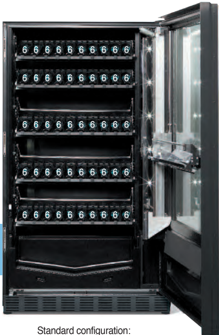
Standard configuration: 1T +3° _ 300 products