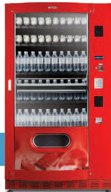
Skudo 1050 Lift