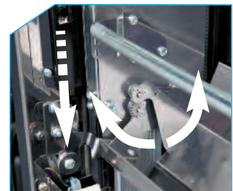
Stainless steel parts with mechanical end opening

Images and illustrations in this leaflet may not be a true representation of the equipment. FAS advise that the products and specifications could change without prior notice.